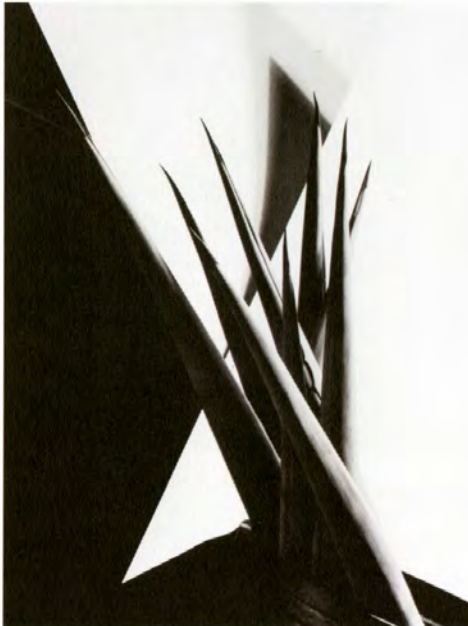
Above, top: John Divola, Untitled , 1974. Gelatin silver print. Purchased with funds provided by the National Endowment for the Arts and the Kress Foundation, Washington, D.C.