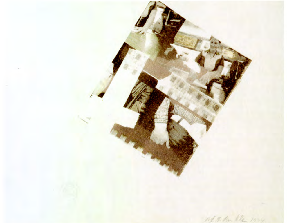
Above: Rodger Klein, Seeing is Believing , 1974. Photolithograph. Purchased with funds provided by the National Endowment for the Arts and the Kress Foundation, Washington, D.C.